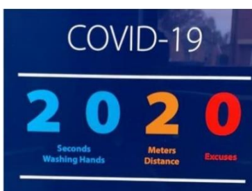
Signage to promote hygiene and social distancing measures