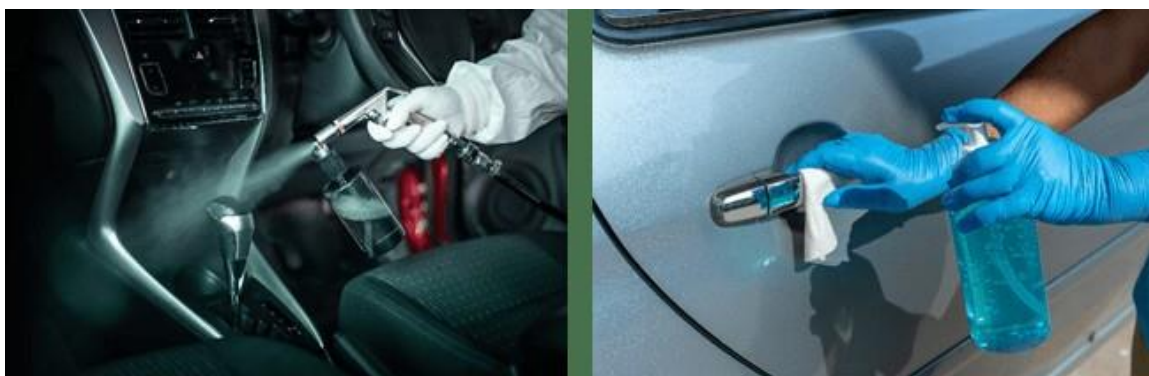
Cleaning of common contact points