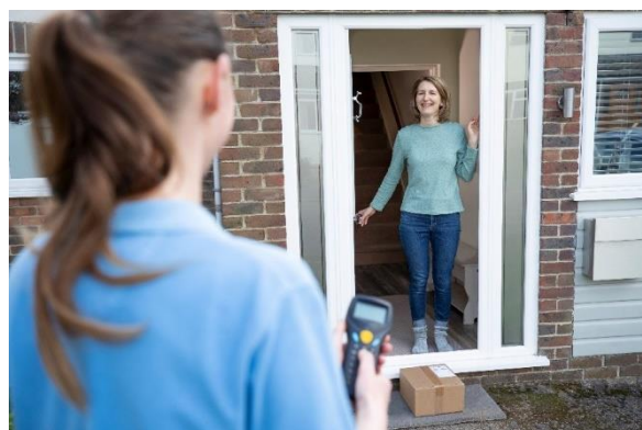
Contact free delivery